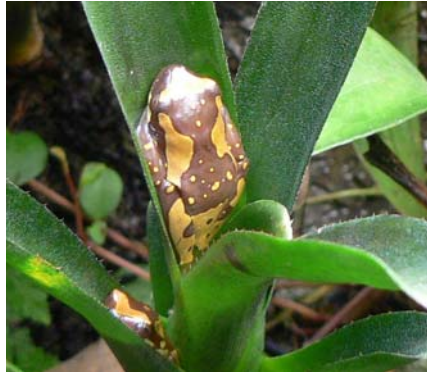
A White-spotted Chochran Frog, part of the Zoo's captive assurance colony

Within the next few months, work will be completed on a new terrarium in the Zoo's Discovery Center. This state of the art terrarium will house endangered amphibian habitats, complete with thunderstorms, rain, and moon light. This truly amazing exhibit will be a self contained eco-system, as true to the amphibian's natural habitat as possible. This latest exhibit is yet another step in the Zoo's commitment to global amphibian conservation efforts. Henry