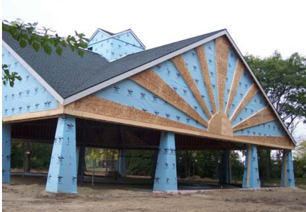
The year-round building that will house the Carousel

Progress continues on the building that will house the Conservation Carousel in the new Children's Zoo. If all goes according to planned with construction and the weather cooperates this winter, the Carousel will begin spinning in the Spring. We will keep you posted regarding a grand opening celebration. There will also be an opportunity for companies interested in sponsoring the grand opening and securing free rides for the public on opening weekend. Many of the animals on the carousel are endangered or threatened in the wild, making this attraction a source of fun, but also an excellent educational opportunity. Only two sponsorships remain available on the carousel.