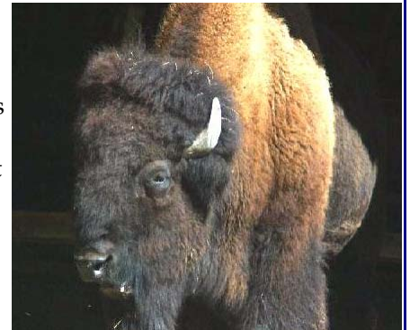
The Zoo's Bison will soon enjoy a new mixed species habitat

its in the Zoo Century vision and it set to open as soon as the final touches are put on the habitat and its residents can be transferred. Highlights will include a board-