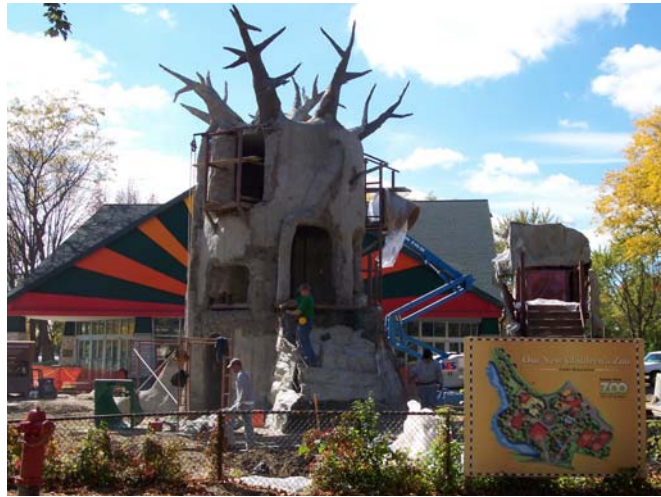
Thanks to a lead gift of $3 million dollars from the Oscar Rennebohm Foundation, and many other generous donations, the Children's Zoo continues to take shape.

The new state of the art exhibits (pictured below, left) for five Children's Zoo residents is also progressing quickly. This structure is located immediately to the south west of the Conservation Carousel building and it will share similar design elements and finishing.