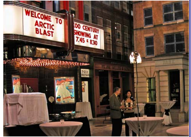
WISC-TV Broadcasts Live from the Arctic Blast on February 24th

Current Zoo Century supporters were brought together with those who were just learning about the plans for the first time. Guests were identified by a committed group of event "Ambassadors" who extended invitations to their contacts and associates. "Our supporters' excitement for the campaign is contagious, and we were able to share that