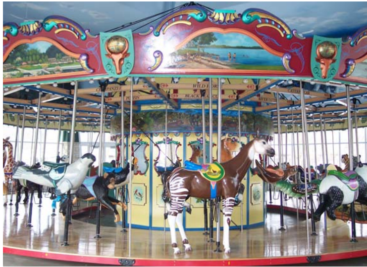
The Conservation Carousel will open to the public on April 8th.

Carousel Works of Mansfield Ohio spent a week at the Zoo assembling the specially designed attraction.